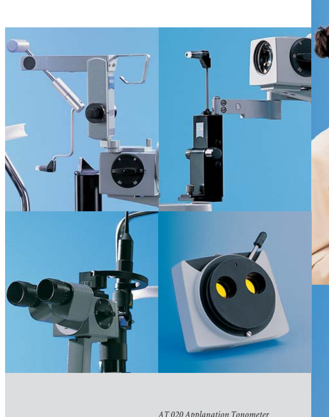
AT 020 Applanation Tonometer AT 030 Applanation Tonometer Laserlink Yellow filter

The extensive line of accessories for the SL 130 Slit Lamp includes devices for digital documentation, applanation tonometers, laser attachments, and a lot more besides.