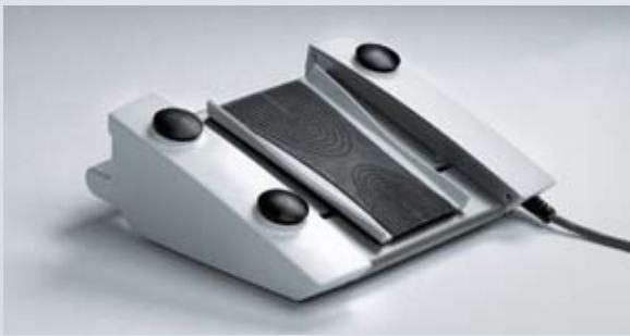
Foot control panel functions are clearly structured

Designed for maximum patient safety, Visalis 100 features a completely closed design. There is no internal tubing requiring cleaning, thus eliminating the risk of cross-contamination while increasing the predictability of outcomes. The system's Adaptive Power Control (APC) provides additional safety by delivering surgeons the minimal power necessary during the procedure. The stroke is measured and stabilized by the microprocessor.